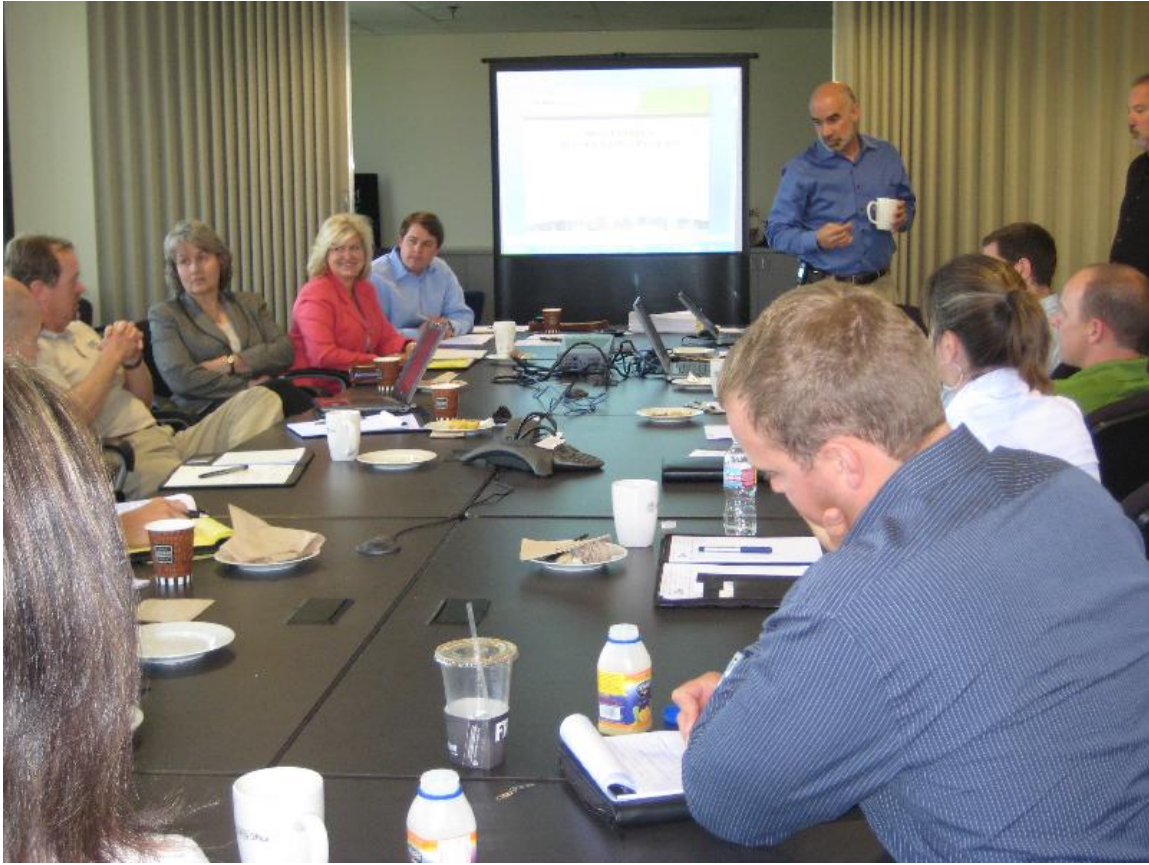
Colorado ESC Chapter meeting circa 2011.