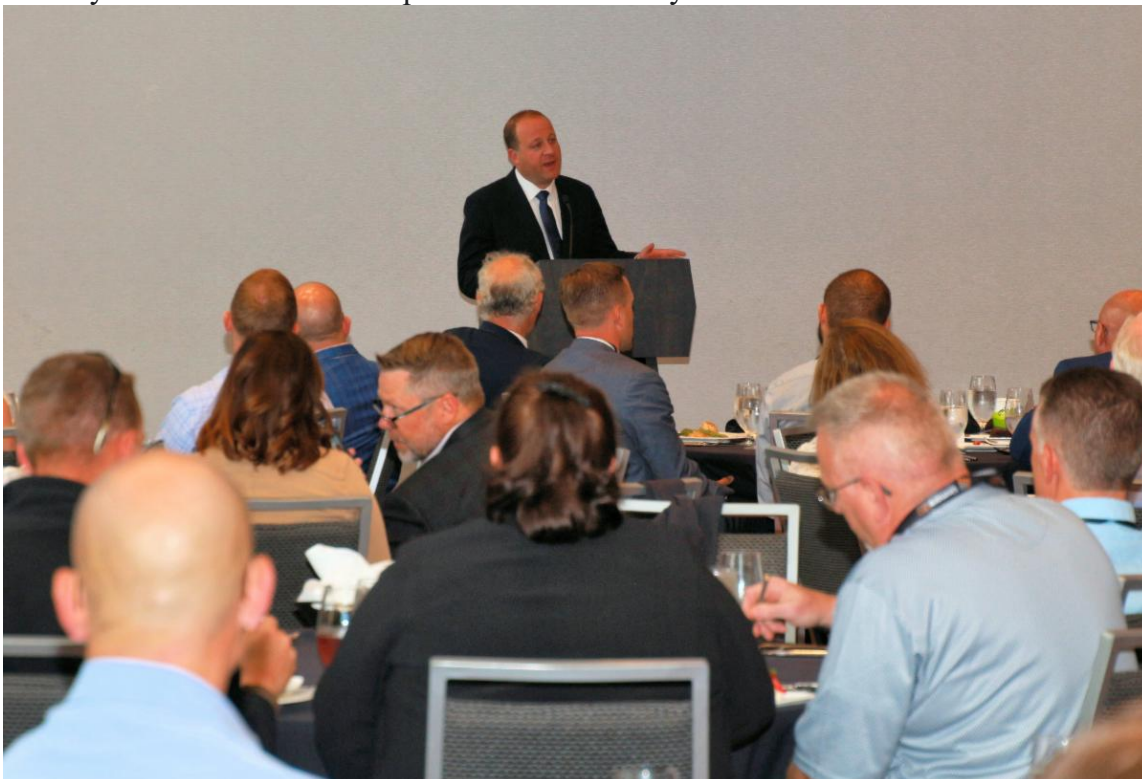
Colorado Governor Polis delivers the Lunch keynote at the 8th Annual ESC Market Transformation Conference.

The Colorado ESC Chapter co-hosted the event and held a pre-conference workshop focused on energy performance contracting practices unique to Colorado. The Conference featured 11 technical sessions and three keynote speakers over the course of two days. Governor Jared Polis provided the lunch keynote.